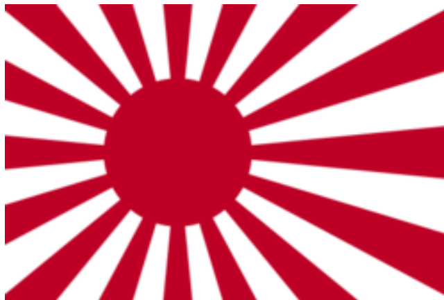
Flag of Japan Maritime Self Defense force